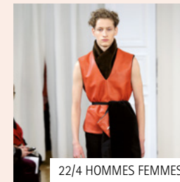
22/4 HOMMES FEMMES